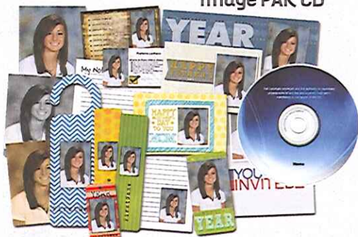
Image PAK CD

The Image PAK CD includes a CD with copyright released image, in addition to an assortment of digital products including: color, B&W white and sepia tone files; a designed notebook paper file; a designed Fun Pack file; a You Are Invited card file; a Happy Mother's Day card file; a Happy Father's Day card file; a My Favorites template; a 10 up sticker page template; a safety ID template and a Facebook Header file.